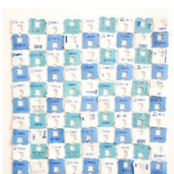
Figure 3: Patterns made with bread tags by @the_breadtag_project

Inspiration: Bread tags (also called bread clips or bread ties) and plastic drink bottle lids are very common in our homes and schools today. Unfortunately, these items are not easy to recycle because of their size and the kind of plastic they are made from. They are a commonly discarded plastic and can be found in all sorts of places in the environment such as parks.