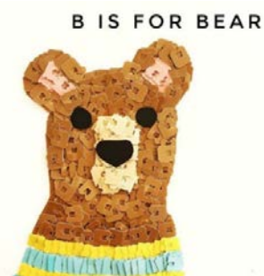
Figure 4: Bread tag artwork by @the_breadtag_project #breadtagalphabet

For ideas on repurposing bread tags see ‘the bread tag project’ @the_breadtag_project. For ideas on repurposing plastic bottle lids see https://envision.org.au/envision-hands/ .