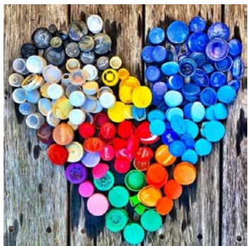
Figure 2: An artwork made by arranging discarded plastic lids Image by @life_islikecamera